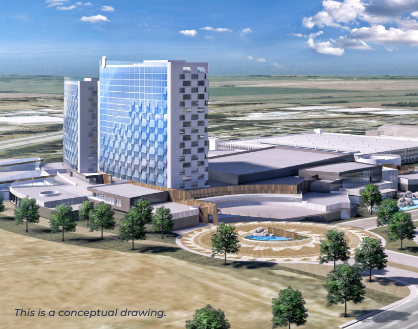
This is a conceptual drawing.